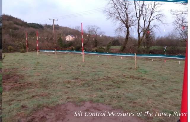
Silt Control Measures at the Laney River