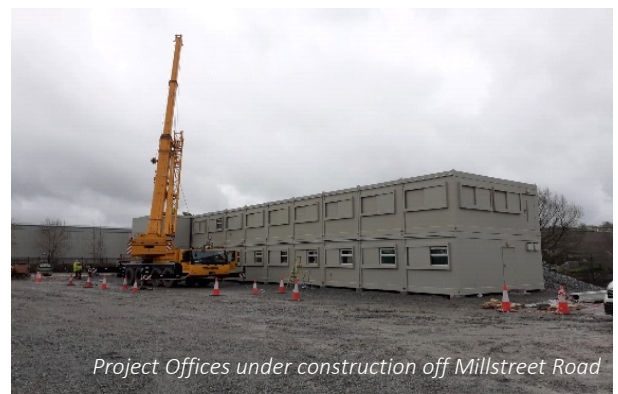
Project Offices under construction off Millstreet Road