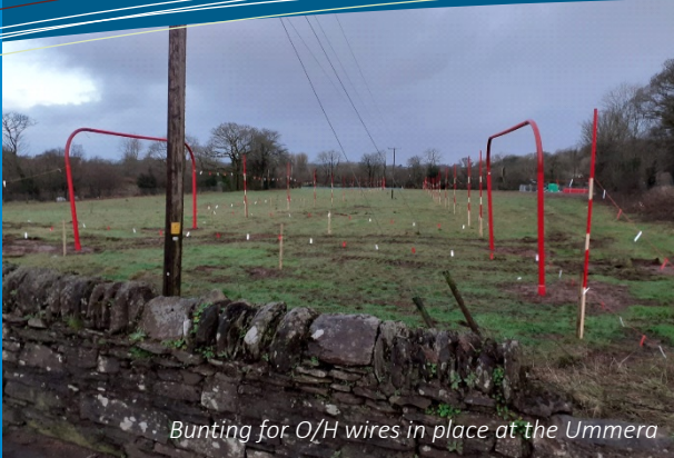
Bunting for O/H wires in place at the Ummerra

N22 BBM Site Offices, Millstreet Road, Macroom, P12 PN24