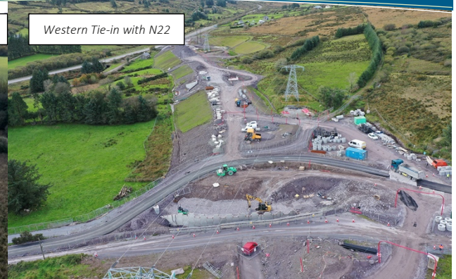
Western Tie-in with N22