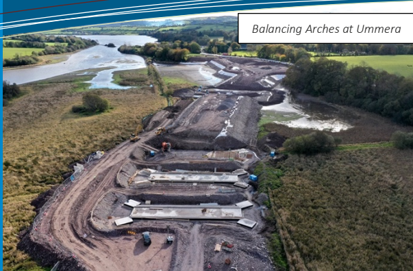
Balancing Arches at Ummera