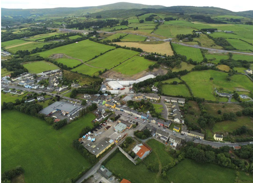
Baile Mhic Íre.

The Gearagh is close to Macroom. This diverse eco-system and is home to huge variety of fish, birds, trees, plants, and animals such as kingfishers, otters, and whooper swans. It is the only ancient post glacial alluvial forest left in Western Europe. It has been a statutory nature reserve since 1987 and is also part of the Lee river Hydroelectrical scheme. The wider geographical area for this scheme is also a habitat for bats, the Kerry slug, freshwater pearl mussels and owls. The N22 development traverses the upper reaches of the Carrigadrohid Reservoir, which is located on the River Lee, upstream of the two hydro power stations. The lake is predominantly associated with coarse fishing for bream, rudd, roach, pike and perch.