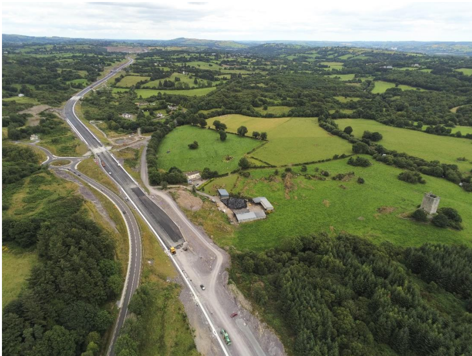
Carrigaphooca Castle.

Carrigaphooca Castle is situated on the outcrop of rock called The Friary Rock in Macroom, County Cork. It is a 16th century tower of 4 storeys below a vaulted roof and turrets on opposing corners at the top. It was built by Dermot Mór MacCarthy sometime between 1436 and 1451. A staircase was added in the 1970's. There is a stone circle two fields to the east of the castle.