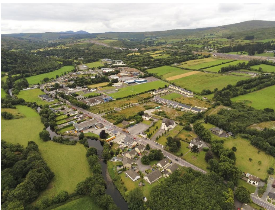
Baile Bhuirne

The Gearagh is close to Macroom. This diverse eco-system and is home to huge variety of fish, birds, trees, plants, and animals such as kingfishers, otters, and whooper swans. It is the only ancient post glacial alluvial forest left in Western Europe. It has been a statutory nature reserve since 1987 and is also part of the Lee river Hydroelectrical scheme. The wider geographical area for this scheme is also a habitat for bats, the Kerry slug, freshwater pearl mussels and owls. The N22 development traverses the upper reaches of the Carrigadrohid Reservoir, which is located on the River Lee, upstream of the two hydro power stations. The lake is predominantly associated with coarse fishing for bream, rudd, roach, pike and perch.