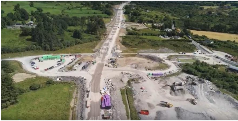
Toonlane Junction.