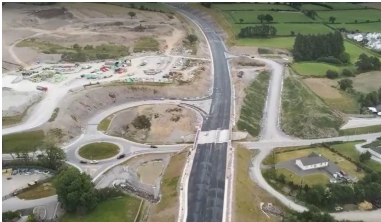
Gurteenroe Junction