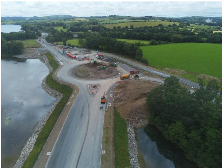
Coolcour Junction.

Drone footage of the development in progress can be viewed here: https://youtu.be/A0uHFSqHY2g