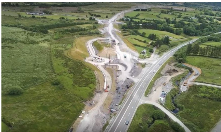
Baile Bhuirne Junction / Western Tie-In.