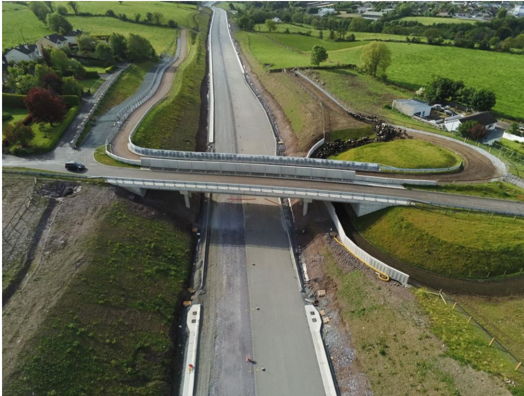
Cattle crossing, Cut 11, north of Macroom.

Macroom is a market town in County Cork, Ireland, located by the River Sullane, halfway between Cork City and Killarney. The town serves an area of central Cork that is rich in agriculture and food production, which is also celebrated as part of the annual Macroom Food Festival. The town is home to several artists, arts groups and organisations including the Briery Gap theatre which is currently being renovated.