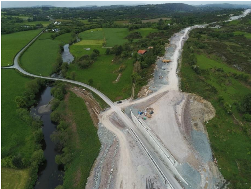
Cill na Martra Road.

An Ionad Cultúrtha an Dochtúir Ó Loinsigh is an arts centre serving the Gaeltacht Mhuscraí, located in Baile Bhuirne. It offers a yearlong arts programme including visual art, music, residencies for visiting artists and courses for the general public.