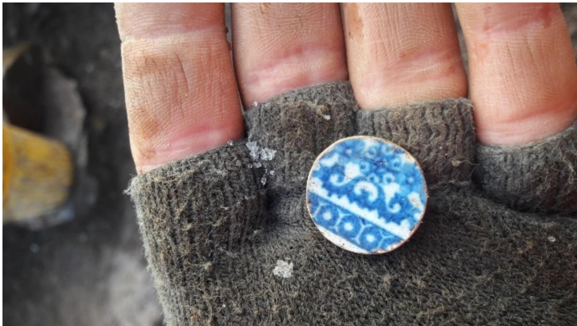
Ceramic Gaming Piece found in Kilclug 1

A total of 25 sites of prehistoric date were excavated along the route of the new N22 prior to construction commencing. The majority of these consisted of Bronze Age burnt mounds or fulacht fiadh , an enigmatic site type where stones were heated in a fire before being placed in a prepared water-filled trough in the ground, the purpose being to heat the water for various reasons, bathing or cooking being the most likely explanation in most cases. Such troughs are often either stone or timber lined, and many complex examples with well-preserved wooden lining were seen here. These sites were found in many locations along the scheme. Further prehistoric sites included a Bronze Age cremation burial of a young woman.